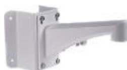
Corner Mount Wall Mount (with Termination Box)